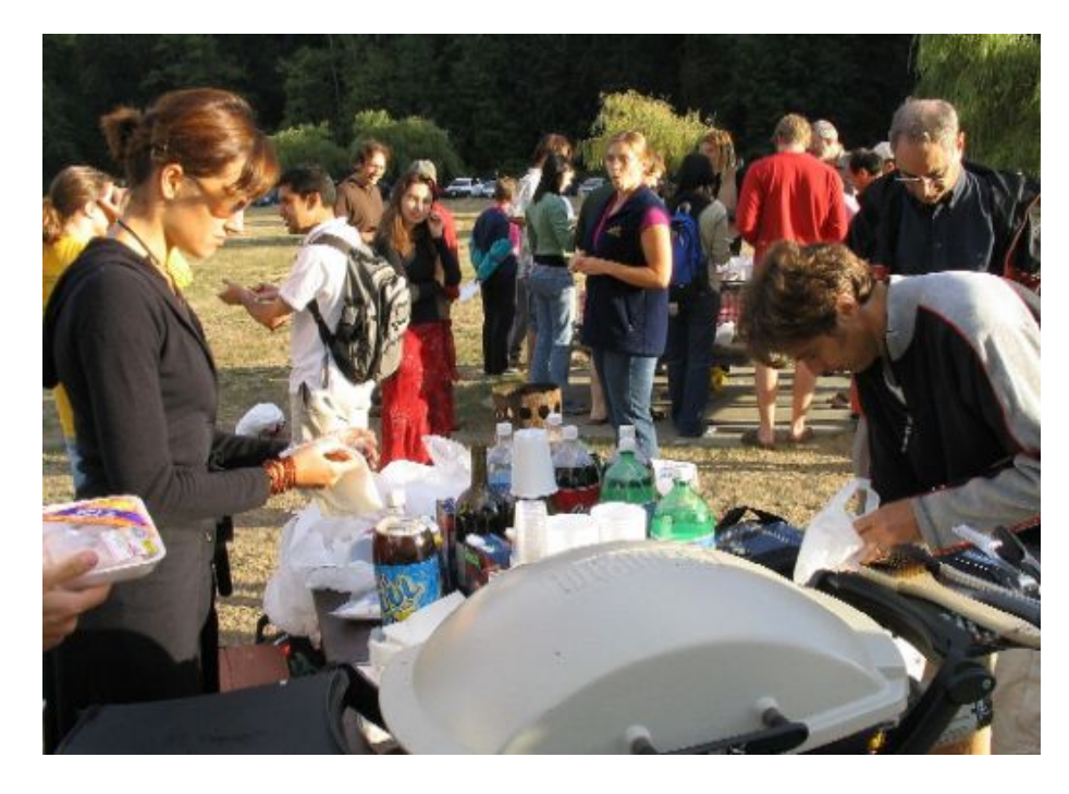
Faculty and students gathered at the Annual IAM BBQ/Potluck held at Spanish Banks in September.